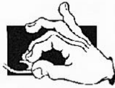
THE TEA DRINKER